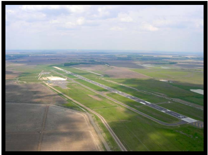
Southwest view of the airport looking north toward the extension project.

The project is in two parts. The base bid consists of paving the runway extension and construction of the parallel taxiway. If funding is not available for entire project, the construction of the parallel taxiway will be completed later in 2008.